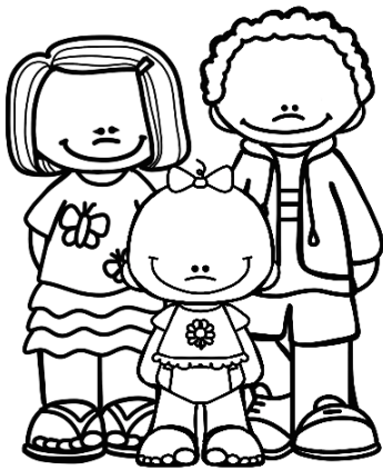
kids who do not have parents

Draw a picture or Write the name of one person you will pray for today: