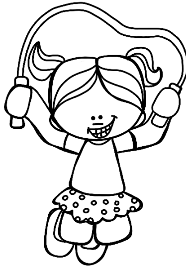
people who are too sick to work and play