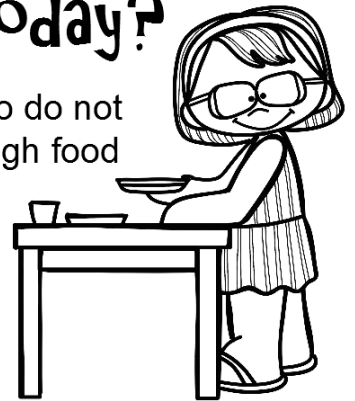
people who do not have enough food