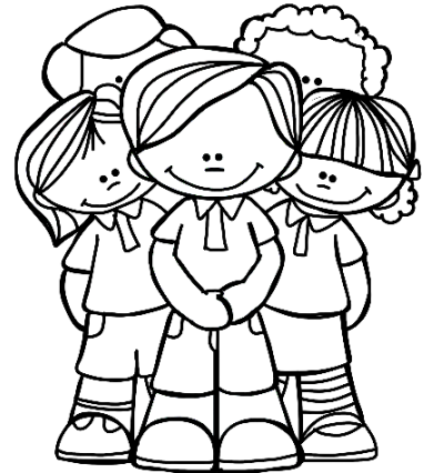
children around the world who have never heard about Jesus